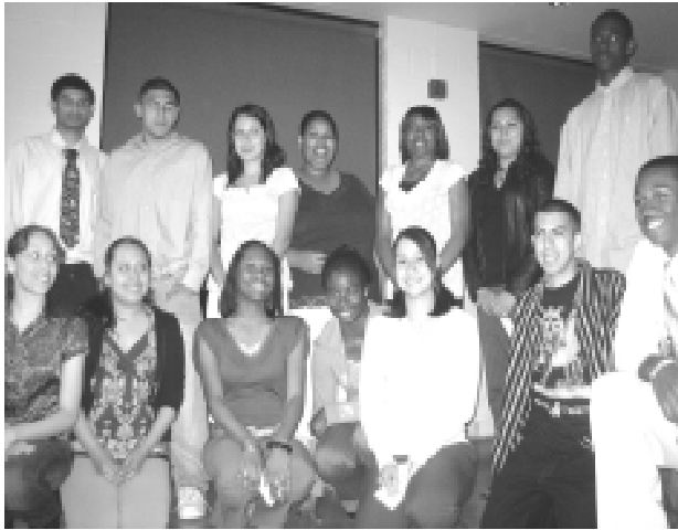
Pictured above: Representatives of the Class of 2007 at the Awards Banquet

On May 17, 2007 a record number of students, parents, mentors and supporters attended Chester County Futures' 11 th Annual End of Year Banquet. The banquet celebrated the achievements of Chester County Futures' students over the 2006-2007 school year.