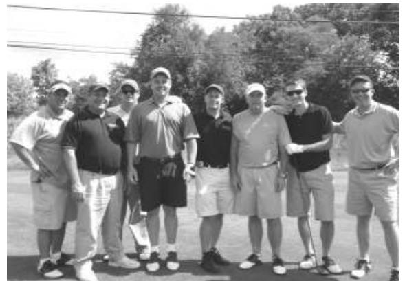
Pictured above: Foursomes representing Title Sponsor Independence Construction Materials and Allan A. Meyers Contractors