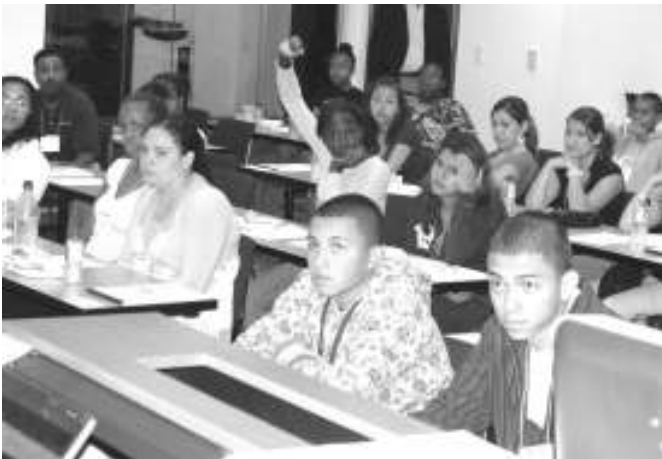
Pictured above: Futures' Students at Microsoft Corporation

A select group of Futures' high school students from Coatesville and Kennett Square attended a Diversity Day hosted by Microsoft Corporation on Tuesday, September 11, 2007.